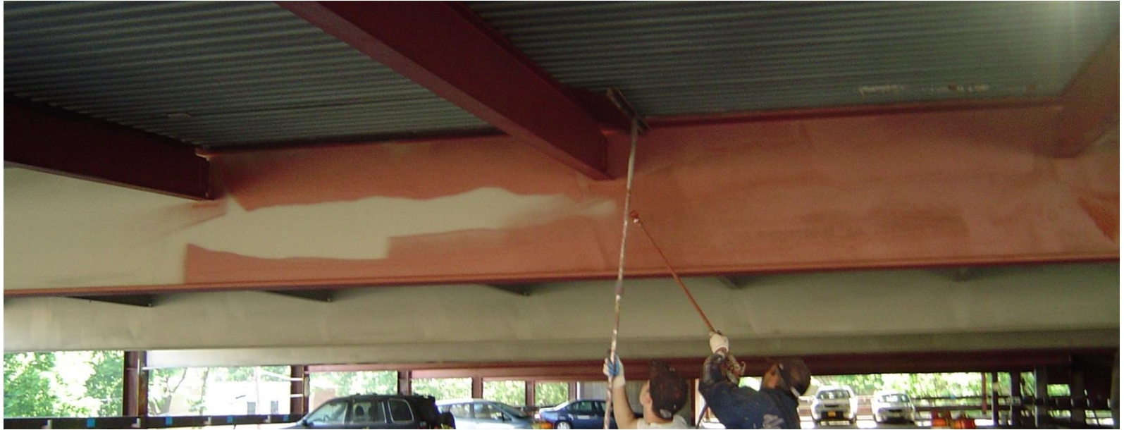
APPLICATION OF SECOND COAT OF RD-ELASTOMETAL.